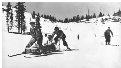
Hoodoo circa 1950's